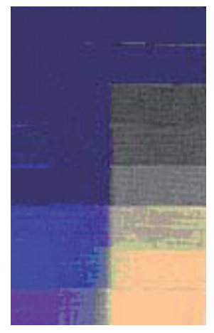
This diagram is for illustrative purposes only.

Typical appearance of unexposed and exposed blue wool strips showing fading after exposure to strong light in an accelerated light fastness test.